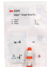
3M™ Adper™ Single Bond Plus Refill Vial (51102)