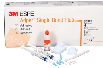
3M™ Adper™ Single Bond Plus Adhesive Intro Kit (51101)