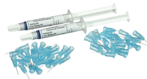
3M™ Scotchbond™ Universal Etchant Etching Gel (41263)