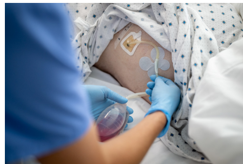
Surgical drains (in conjunction with sutures)

Feel secure in your choice. Trust the science behind 3M™ Tube Securement Device for reliable performance.