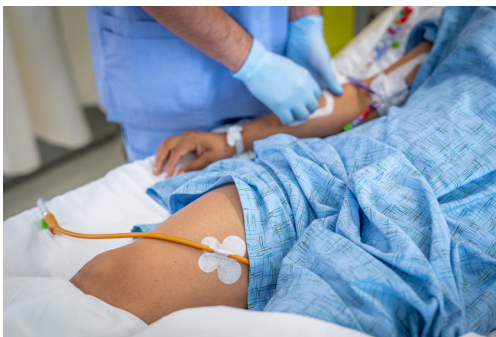
Urinary catheters (in conjunction with urinary catheter balloons)

It is also indicated for securing urinary catheters and surgical drains.