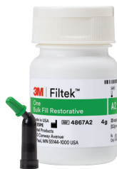
3M™ Filtek™ One Bulk Fill Restorative

And, it helps you deliver predictable, robust outcomes. All you need is the new 3M™ RelyX™ Fiber Post 3D Glass Fiber Post plus three other easy-to-use 3M products: 3M™ RelyX™ Unicem 2 Automix Cement, 3M™ Scotchbond™ Universal Adhesive, and 3M™ Filtek™ One Bulk Fill Restorative. These four products have one common objective: Simplify the complex!