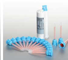
3M™ Paradigm™ Temporization Material Refill – A2