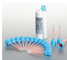
3M™ Paradigm™ Temporization Material Refill – A1