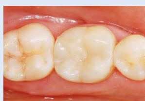
6. Final restoration