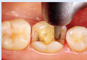
2. Tooth preparation