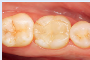
1. Initial situation