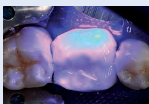
5. Light cure each surface