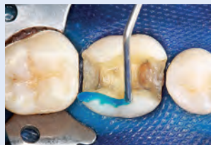
3. Selective etch