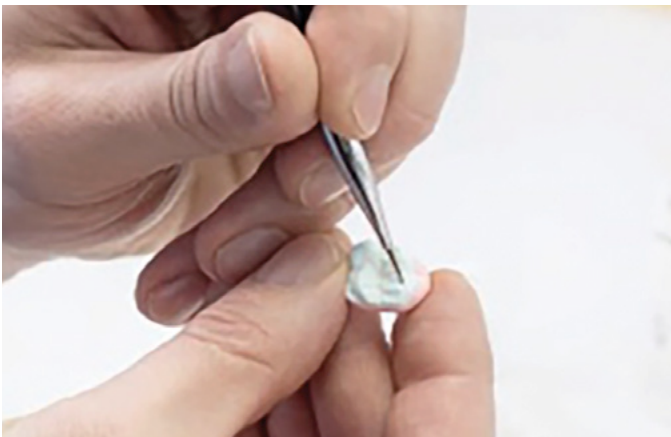
Fig. 2: Custom gradient shading provides a warm natural appearance and extra esthetic characteristics.

For situations that call for a higher esthetic result, artisan labs can also use the Lava™ Plus High Translucency Zirconia Shading System to replicate the look of a hand-layered porcelain veneered restoration. Multiple applications of the Dyeing Liquids can be used to increase the concentration of color ions in specific areas to increase shade intensity. This can be used, for example, to create a darker cervical region. The Lava™ Plus High Translucency Zirconia Enamel Liquids offer the flexibility to achieve a differentiated shade on the occlusal surfaces and the Effect Shades can be used to create specific highlights and nuances (Figure 2). A skilled technician can create unparalleled restorations that are not possible with the simpler dip shading method and will be virtually undetectable for patients.