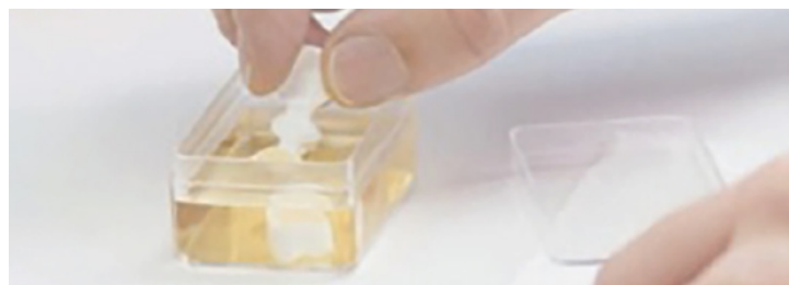
Fig. 1: Monochrome dip shading offers quick and easy esthetics.

Lava Plus zirconia offers the flexibility to shade milled restorations on demand. If a monochromatic restoration will meet your esthetic needs, then 16 VITA® classical and two bleach shades can be produced using a dip shading technique, a fast and easy process where the color ions in the shading liquid are evenly absorbed throughout the restoration. The technician simply submerges the pre-sintered restoration in the dyeing liquid and lets it sit for two minutes (Figure 1). Upon drying, the carrier liquid evaporates and the color ions are locked in place by the special chemistry 3M scientists designed into the Lava Plus zirconia liquids. During the final sintering process, the color ions become part of the zirconia crystal structure, resulting in coloration that comes from throughout the depth of the restoration. If your dentist needs to make a minor adjustment, the burr won't create a white spot because the coloration is throughout the body of the restoration.