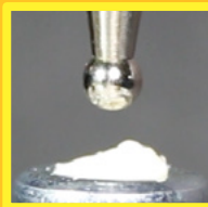
Ketac™ Universal Aplicap™ Glass Ionomer Restorative

As proof, a laboratory test was performed. A metal ball plunger was dipped into the mixed paste of each restorative material and withdrawn immediately. Test photos show that Ketac™ Universal Aplicap™ Glass Ionomer Restorative did not stick to the metal ball, while the other glass ionomer materials tested displayed a clear “pull back”—or stickiness—when the ball plunger was lifted. 1