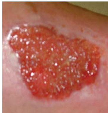
Day 14: post-treatment