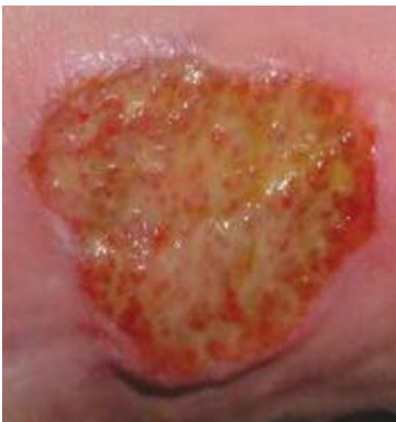
Day 0: pre-treatment