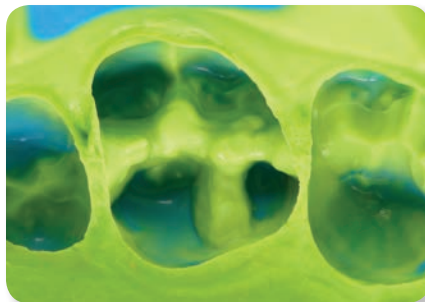
Impression made with Imprint™ 4 Penta™ Heavy and Imprint™ 4 Regular VPS Impression Material using the 1-step technique.

Available in a wide range of viscosities— from Putty to Light Body—Imprint™ 4 VPS Impression Material offers essential benefits for the 1-step and 2-step impression techniques. All tray materials— including Putty—are available for fast and convenient automatic mixing with the Pentamix™ 3 Automatic Mixing Unit and Pentamix™ 2 Automatic Mixing Unit from 3M ESPE.