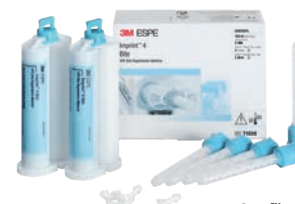
3M™ Imprint™ 4 Bite Refill (71529)