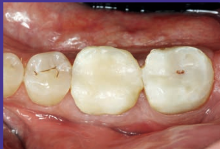
Provisionals made with 3M™ Protemp™ Plus Temporization Material in place.