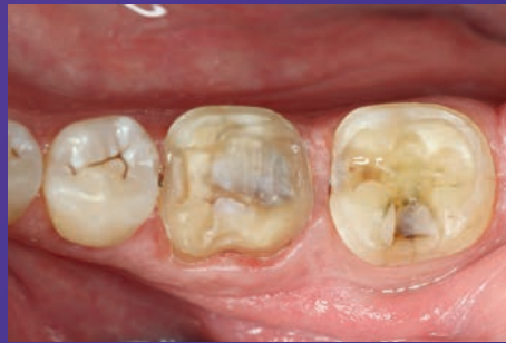
Removal of old composite and amalgam fillings and final preparation for partial crowns.