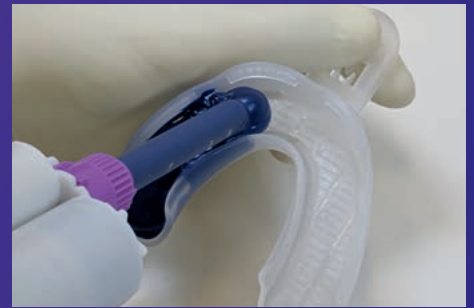
Filling of 3M™ Impression Tray with 3M™ Impregum™ Super Quick Medium Body Polyether Material out of the 50 ml 3M™ Garant™ Cartridge.