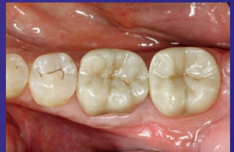
Final 3M™ Lava™ Esthetic Fluorescent Full-Contour Zirconia partial crowns cemented with 3M™ RelyX™ Unicem 2 Self-Adhesive Resin Cement.

Please refer to the instructions for use for complete product information.