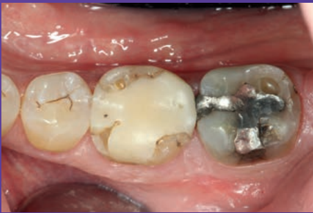
Both lower molar restorations in need of replacement.