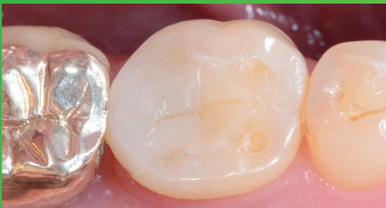
Fig. 10: Final restoration at a recall visit 4 months after placement is natural-looking and esthetic.