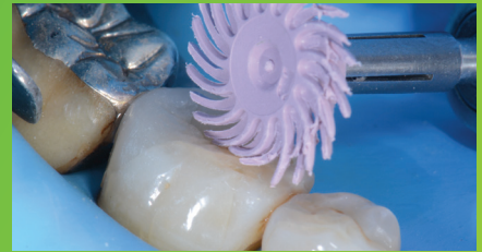
Fig. 9: Polishing with 3M™ Sof-Lex™ Diamond Polishing Spiral to create a final smooth and high-gloss polish for a natural-looking restoration.