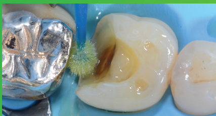
Fig. 4: 3M™ Scotchbond™ Universal Adhesive is applied for 20 seconds.