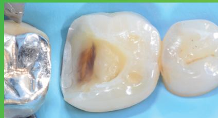
Fig. 2: The tooth is isolated and the insufficient composite restoration completely removed.