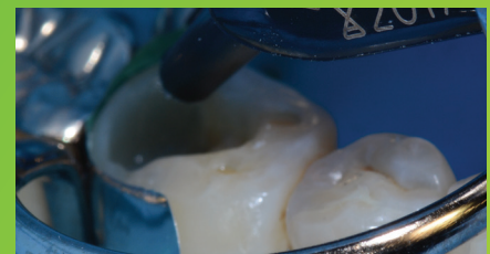
Fig. 6: 3M™ Filtek™ One Bulk Fill Restorative, shade A3, is placed directly into the cavity and then cured according to the Instructions for Use.