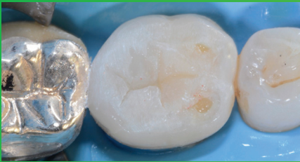
Fig. 7: 3M™ Filtek™ One Bulk Fill Restorative surface finished before final polishing.