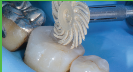
Fig. 8: Pre-polishing of restoration with 3M™ Sof-Lex™ Pre-Polishing Spiral.