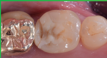
Fig. 1: Initial situation: Fractured composite restoration of first lower molar.