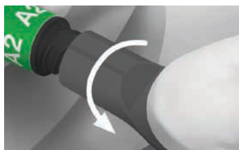
Remove the cap.