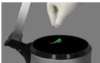
Discard the dispensing tip.