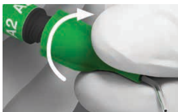
Attach the new tip.