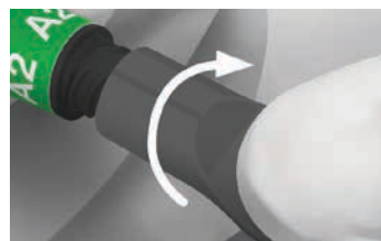
Put the cap back on.