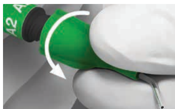
Remove the tip.