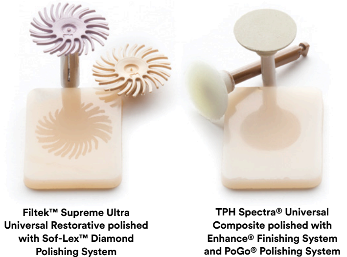
Filtek™ Supreme Ultra Universal Restorative polished with Sof-Lex™ Diamond Polishing System