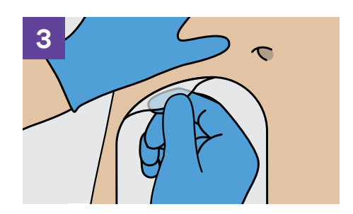
Position the patient and remove the ostomy pouch/flange.