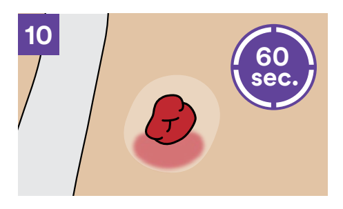
Allow the product to dry for a minimum of 60 seconds before applying the ostomy pouch or flange.