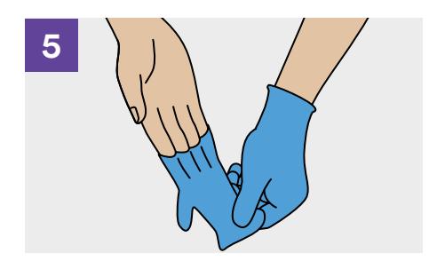
Change your gloves.