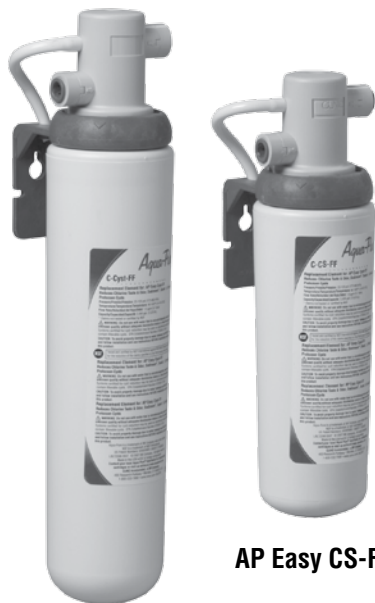
AP Easy CS-FF