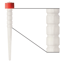
Fig. 3: The coronal macro retention of 3M" RelyX" Fiber Post 3D give a high and secure mechanical retention to the core build-up material, immediate depth control and guidance for post shortening.