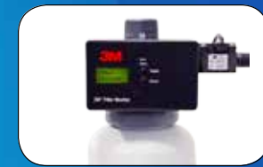
BH3M-NPT Head 6240809