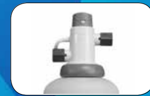
BH3-NPT Head 6240807

The Clear Choice for Commercial Applications