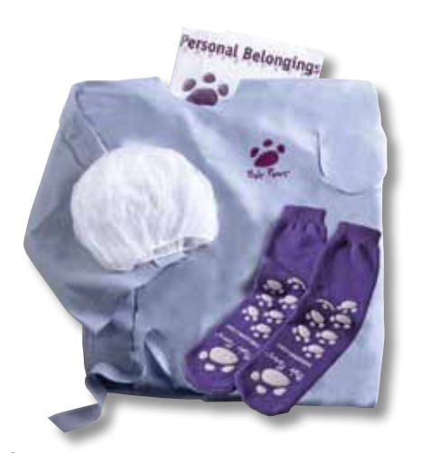
Gown kit includes patient warming gown, bonnet, booties, personal belongings bag and shoe bag.