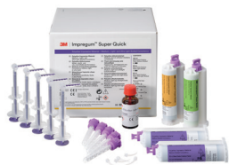
3M™ Impregum™ Super Quick Medium Body/Light Body/Ultra Light Body Introductory Kit (69421)