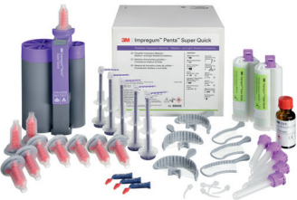
3M™ Impregum™ Penta™ Super Quick Medium Body/Light Body Introductory Kit (69415)