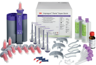
3M™ Impregum™ Penta™ Super Quick Heavy Body/Light Body Introductory Kit (69407)