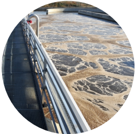
Waste Water Treatment