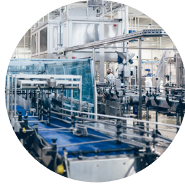
Industrial Water Systems