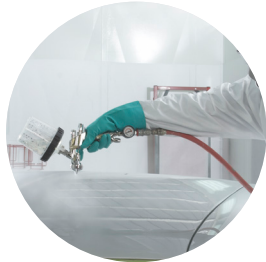
Paints and Coatings