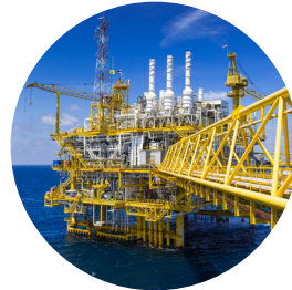
Upstream Oil and Gas