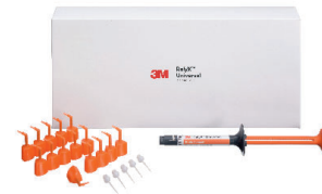
3M™ RelyX™ Universal Resin Cement Refill TR (56971)