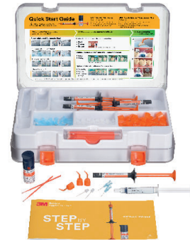
3M™ RelyX™ Universal Resin Cement Intro Kit (56968)

41263 2x 3M™ Scotchbond™ Universal Etchant (3 ml each), 50 dispensing tips