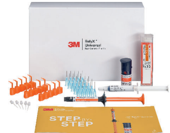
3M™ RelyX™ Universal Resin Cement Trial Kit TR (56969)