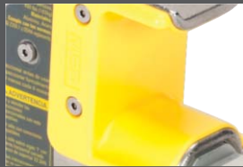
(A) Beam glide