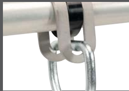
(B) Load indicator