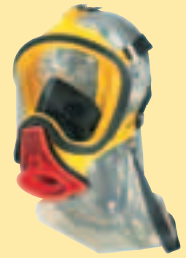
Ultra Elite-PS-MaXX-Silicone 10031384