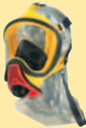
Ultra Elite-PS-Silicone D2056764