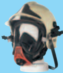
Ultra Elite-H-PS-F1 10045897