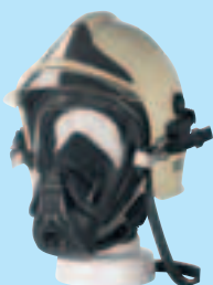
Ultra Elite-H-F1 10045891