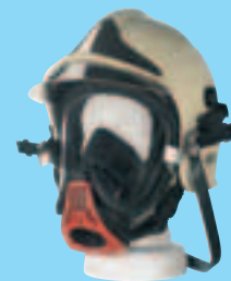
Ultra Elite-H-PF-F1 10045893