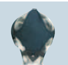
EZ [Easy-Don] Nomex harness