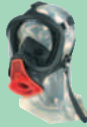
Ultra Elite-PS-MaXX 10031385

Full face masks for two-way breathing with spring loaded exhalation valve. For compressed air breathing apparatus with AutoMaXX-AS positive pressure demand valve.