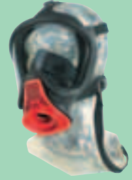
Ultra Elite-PS-MaXX-EZ 10031382