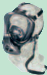
Ultra Elite w. transponder 10013876