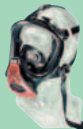
Ultra Elite-PF D2056741

Full face masks for two-way breathing with spring loaded exhalation valve. For compressed air breathing apparatus with suitable positive pressure lung governed demand valve.