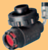
LA 88-AS D4075906