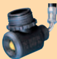
LA 96-N D4075852