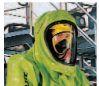
Perfect inside total encapsulating suits due to ergonomic design