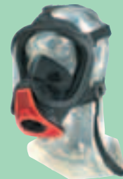
Ultra Elite-PF-EZ D2056771