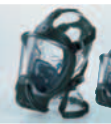
Available in standard and small sizes