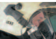
Exclusive MSA Adapters for Mask-Helmet- Combinations