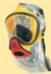
Ultra Elite-PF-Silicone D2056763