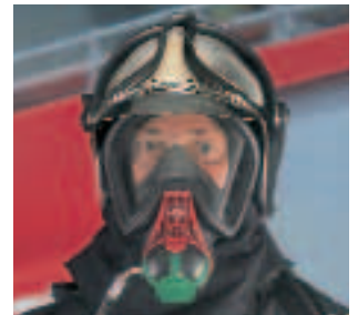
Lens with plane design for an excellent field of vision