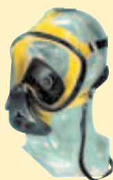
Ultra Elite-Silicone D2056718