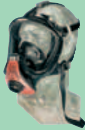
Ultra Elite-PS w. transponder 10026552