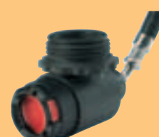
LA 96-AE D4075851