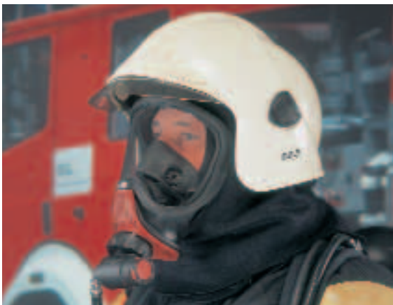
Masks for Mask- Helmet-Combinations [MSA GALLET]