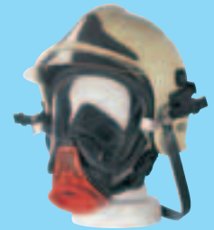
Ultra Elite-H-PS-MaXX-F1 10045899