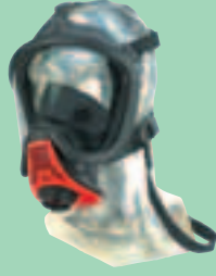
Ultra Elite-PS-EZ D2056772