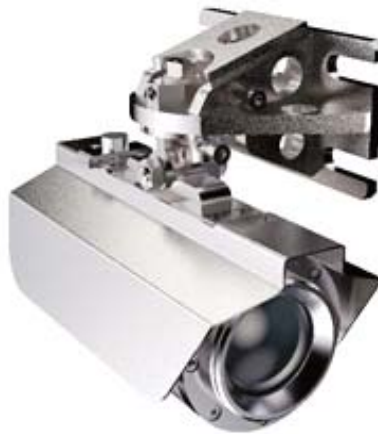
Senscient ELDS Methane FM Variant Detector

Complete with integral junction box, 3/4" NPT, sunshades and mounting brackets. FM 6325 Performance Approved.