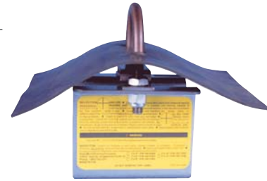
Permanent Roof Anchor 2" x 4" P/N 10016468