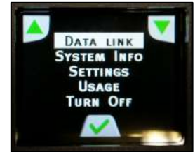
Step 2 & 3

Step 3: Scroll down and choose Data Link with the red CM button. (To scroll up and down, use the green reset buttons.)