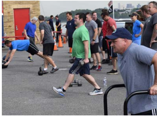
Boston partnered with O2X to create a total health program, specifically designed for firefighters.

In addition to the policy and procedural changes within the department, a key part of our strategy is actively participating in the industry. The BFD has reached out to the world-leading academics and researchers to fully understand the challenges faced by firefighters. We are participating in several national studies aimed at understanding and improving firefighter health. We have forged relationships with other departments to share information. In addition, we recently