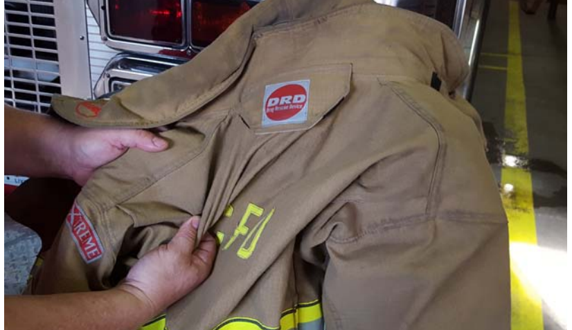
Gear should be routinely inspected after each use, by the wearer, looking for any signs of damage.

rior of the fabric be patched as well to prevent further damage from washing and general wear.