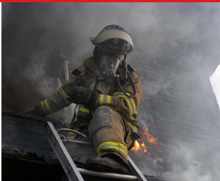
Firefighters are expected to perform a variety of movements in demanding environments, highlighting the importance of gear that moves with the body and supports decreased stress on the wearer.

much as possible. But a host of factors conspire to put physiological stress on your body; that includes wearing protective and insulated clothing.