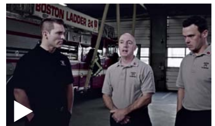
Boston's first video sought to raise awareness of the effects of cancer, not only on the members themselves, but also on their families and friends. The second video outlined the resources available to BFD members to help limit their exposure to carcinogens.