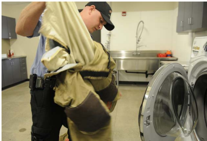
When performing advanced cleaning, separate outer shells from liners, remove drag rescue devices and suspenders, and wash independently.