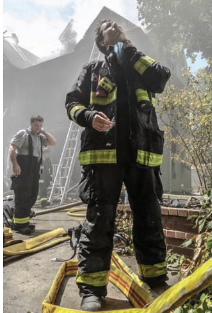
Post-incident cleaning wipes are available on every piece of BFD apparatus.

Simultaneously, as we began the video production, we were also implementing changes in the department in regards to reducing exposure to carcinogens. The department completed a bunker gear census and found more than 75 percent of all bunker gear was not compliant. At the same time, we began an NFPA 1851-compliant inspection and cleaning program. Old and non-compliant gear was removed from service and new gear was issued. All members at this time have two fully compliant sets of bunker gear that are cleaned and inspected at least annually by an independent service provider (ISP). We also made cleaning of the bunker gear a requirement after a member works at a fire. This was initially through the ISP, but in partnership with the Kathy Crosby-Bell and the Last Call Foundation, extractors are being installed in every firehouse. The extractors give the membership another option in cleaning their gear. Firefighters can now choose to clean their gear themselves or send it out to be cleaned. We issued two hoods to each member and will shortly begin the process of issuing another set of boots and gloves to each member. New SOPs were issued regarding when and for how long masks should be worn. Post-incident