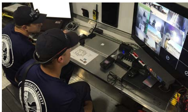
Left: As part of the 2015 research, the team monitored biological uptake of chemicals by collecting firefighters' blood, breath and urine. Right: In 2016, the research was extended to investigate the effects of different training situations on the same environmental factors, chemical exposures, and biological and physiological measures.

viding protection from chemical exposure. The "Firefighter Chemical Exposure and Cardiac Strain Research" projects address the two major health threats that firefighters face in a comprehensive way.