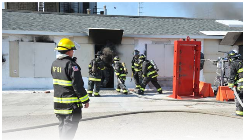
As part of the research, firefighters extinguished fires using either an interior focused attack in which they entered the front door and advanced the line to the fire in the bedrooms, or a transitional attack (initial knock down from the window before entering the front door).

PPE was originally designed to protect against water. But, in more recent history, the primary function of PPE, especially turnout gear, has been to protect against thermal injuries. It is clear that PPE is absolutely necessary to protect firefighters; it guards against multiple hazards, including thermal insult, abrasions, puncture, and chemical exposure. However, PPE also adds a significant burden to the wearer, especially in terms of the weight, which increases work, and the thermal properties, which can