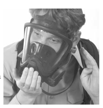
Ultra Elite Facepiece

2. Test the exhalation valve, take a deep breath and hold it. Block the inlet connection with the palm of your hand and exhale. If the exhalation valve is stuck, you may feel a heavy rush of air around the facepiece.