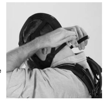
Advantage 4000 Facepiece

3. Tighten the lower (neck) harness straps first, by pulling them straight back, not out. Tighten the temple straps the same way. Tuck in the ends of the straps so that they lay flat across the head.