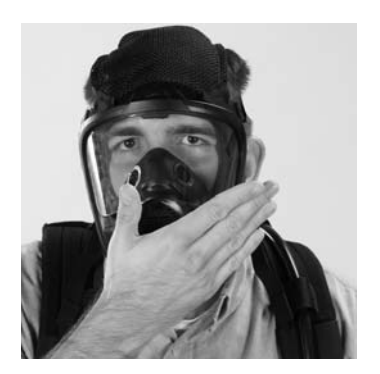
Advantage 4000 Facepiece

2. Test the exhalation valve, take a deep breath and hold it. Block the inlet connection with the palm of your hand and exhale. If the exhalation valve is stuck, you may feel a heavy rush of air around the facepiece.