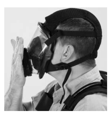
Advantage 4000 Facepiece

Note: You may need to exhale sharply to open the valve. If this does not release the valve, do not use the face-piece.