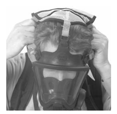
Ultra Elite Facepiece

Pull the head harness completely over your head and tighten the lower (neck) straps.