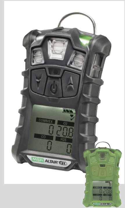
Phosphorescent housing available