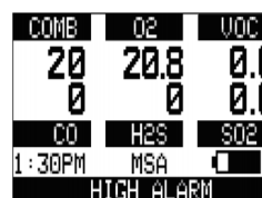
Upcoming ALTAIR 5X PID Monochrome Display