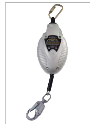
62209-00US (Stainless Steel Cable – 30 ft)

Note: This Bulletin contains only a general description of the products shown. While uses and performance capabilities are described, under no circumstances shall the products be used by untrained or unqualified individuals and not until the product instructions including any warnings or cautions provided have been thoroughly read and understood. Only they contain the complete and detailed information concerning proper use and care of these products. Specifications subject to change without notice.