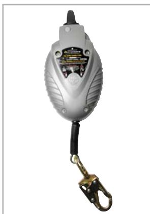
62407-00US (Galvanized Cable – 23 ft)