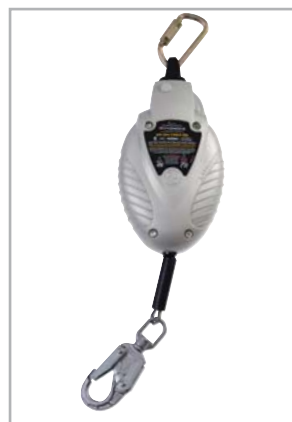
62409-00US (Galvanized Cable – 30 ft)