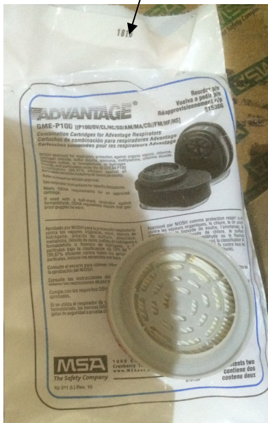
GME-P100 Bag w/P100 Cartridge

Date Code 1816 or 3116 (may be at top or bottom of bag)