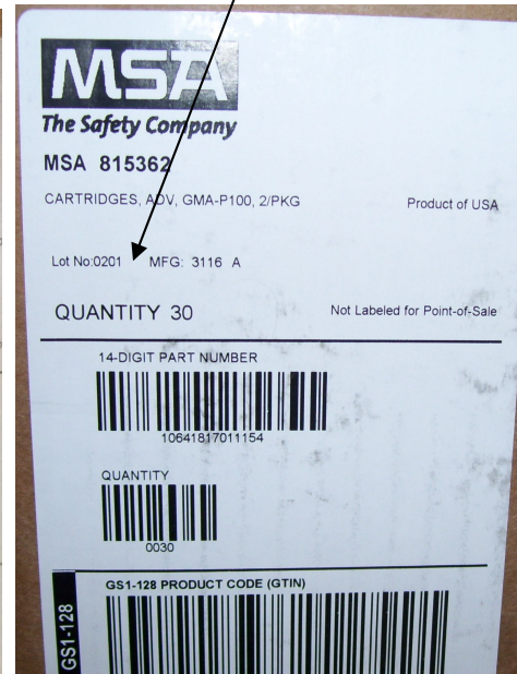
GMA-P100 Cartridge Over-Pack Label