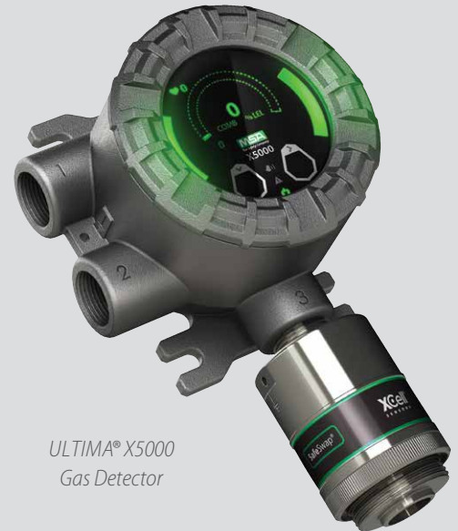
ULTIMA® X5000 Gas Detector

Recommended solution would be an ULTIMA® X5000 Gas Detector with a combustible sensor. When locating the sensors keep in mind that natural gas is lighter than air; therefore, gas sensors should be located over potential leak areas such as: the gas shutoff valve, air intake, gas meter, and the burner assembly as well as the gas train assembly.