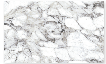
GYPSUM CALACATTA CM22 6mm – Glossy | 48 x 96 Bookmatch available