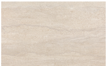
DAWN HS05 6mm – Honed 32 x 72, 32 x 90 & 36 x 90 Vein-cut *Coordinates with Haddonstone™ Tile Series