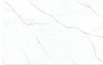
AURALINE CM90 6mm – Glossy 32 x 72, 32 x 90 & 36 x 90 Infinity Veining