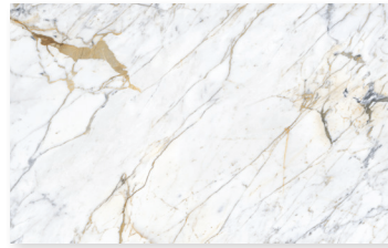
DIAMOND MINE CM12 6mm – Glossy | 48 x 96 Bookmatch available *Coordinates with Panoramic Duet™ Tile Series