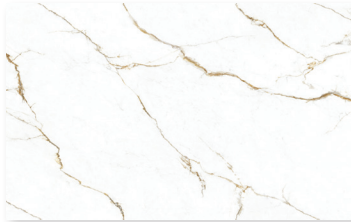
LEMURIAN CM49 6mm – Glossy 32 x 72, 32 x 90, 36 x 90 & 48 x 96 Infinity Veining in 32 x 72, 32 x 90 & 36 x 90 Bookmatch available in 48 x 96 size only