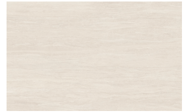
PEONY HS04 6mm – Honed 32 x 72, 32 x 90 & 36 x 90 Vein-cut *Coordinates with Haddonstone™ Tile Series