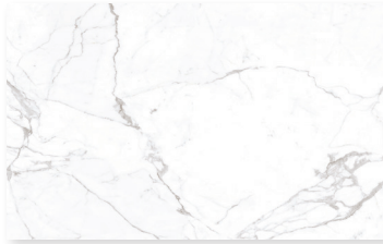
STATUARIO CM03 6mm – Glossy | 48 x 96 Bookmatch available