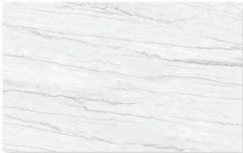
SELENITE CM51 6mm – Matte | 48 x 96