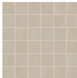
MD06 Morning Haze