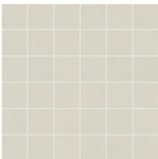
MD05 Soft Cloud