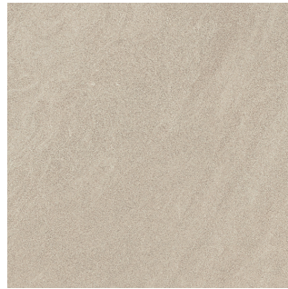
MD06 Morning Haze