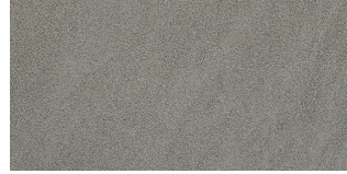
MD09 Stormy Sky