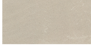
MD06 Morning Haze