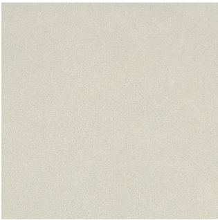
MD05 Soft Cloud