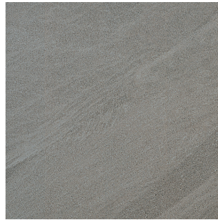
MD09 Stormy Sky