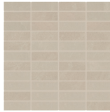
MD06 Morning Haze