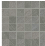
MD09 Stormy Sky