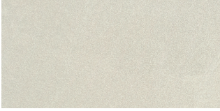
MD05 Soft Cloud