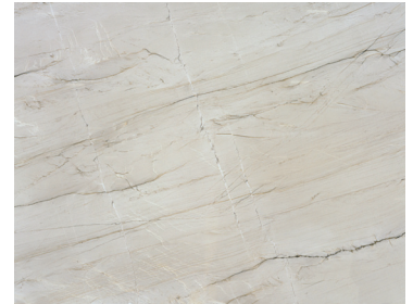
BIANCO SUPERORI Q778 3/4" (2cm) & 1-1/4" (3cm) Polished & Honed