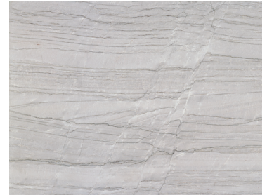
PEGASUS WHITE Q767 3/4" (2cm) & 1-1/4" (3cm) Polished