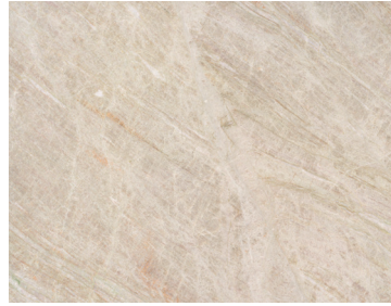
TAJ MALLORCA Q406 3/4" (2cm) & 1-1/4" (3cm) Polished