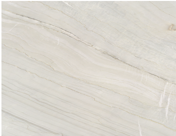
DUMONT Q776 3/4" (2cm) & 1-1/4" (3cm) Polished & Leather