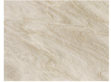
TAJ MAHAL Q801 3/4" (2cm) & 1-1/4" (3cm) Polished, Leather & Honed