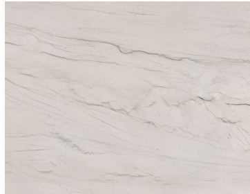
MONT BLANC Q802 3/4" (2cm) & 1-1/4" (3cm) Polished