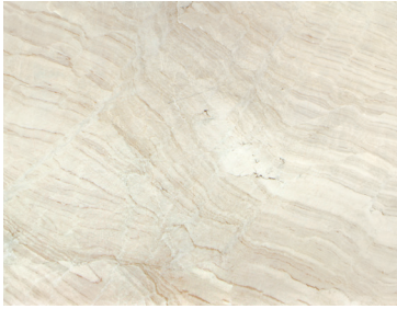
MONTEBELLO Q545 3/4" (2cm) & 1-1/4" (3cm) Polished