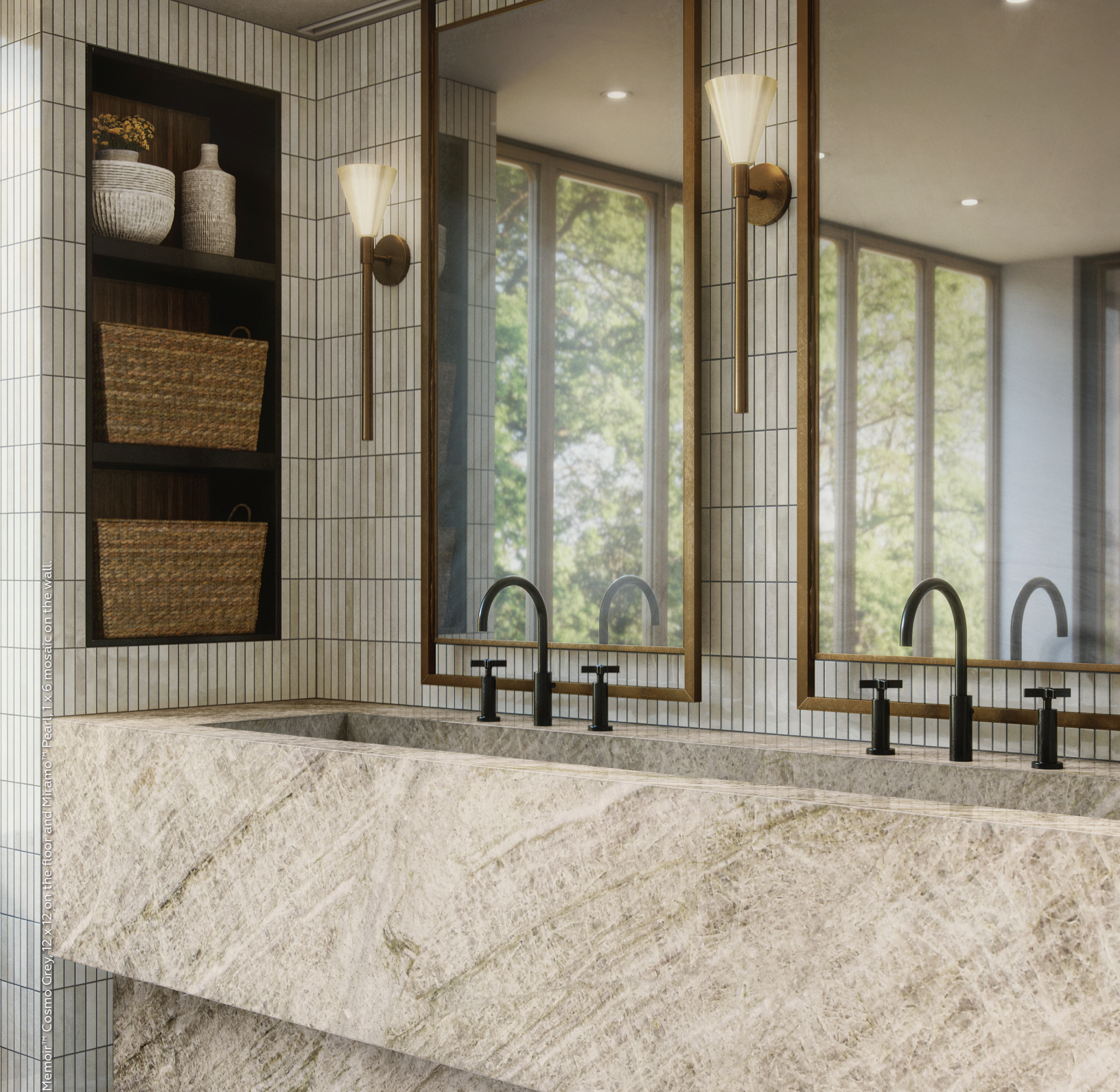
Photo features Taj Mallorca on the countertop, Memoir™ Cosmo Grey, 12 x 12 on the floor and Miramo™ Pearl, 1 x 6 mosaic on the wall.