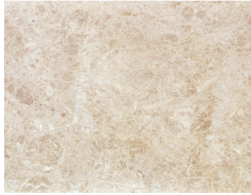
TUSCAN DUNE Q559 3/4" (2cm) & 1-1/4" (3cm) Polished