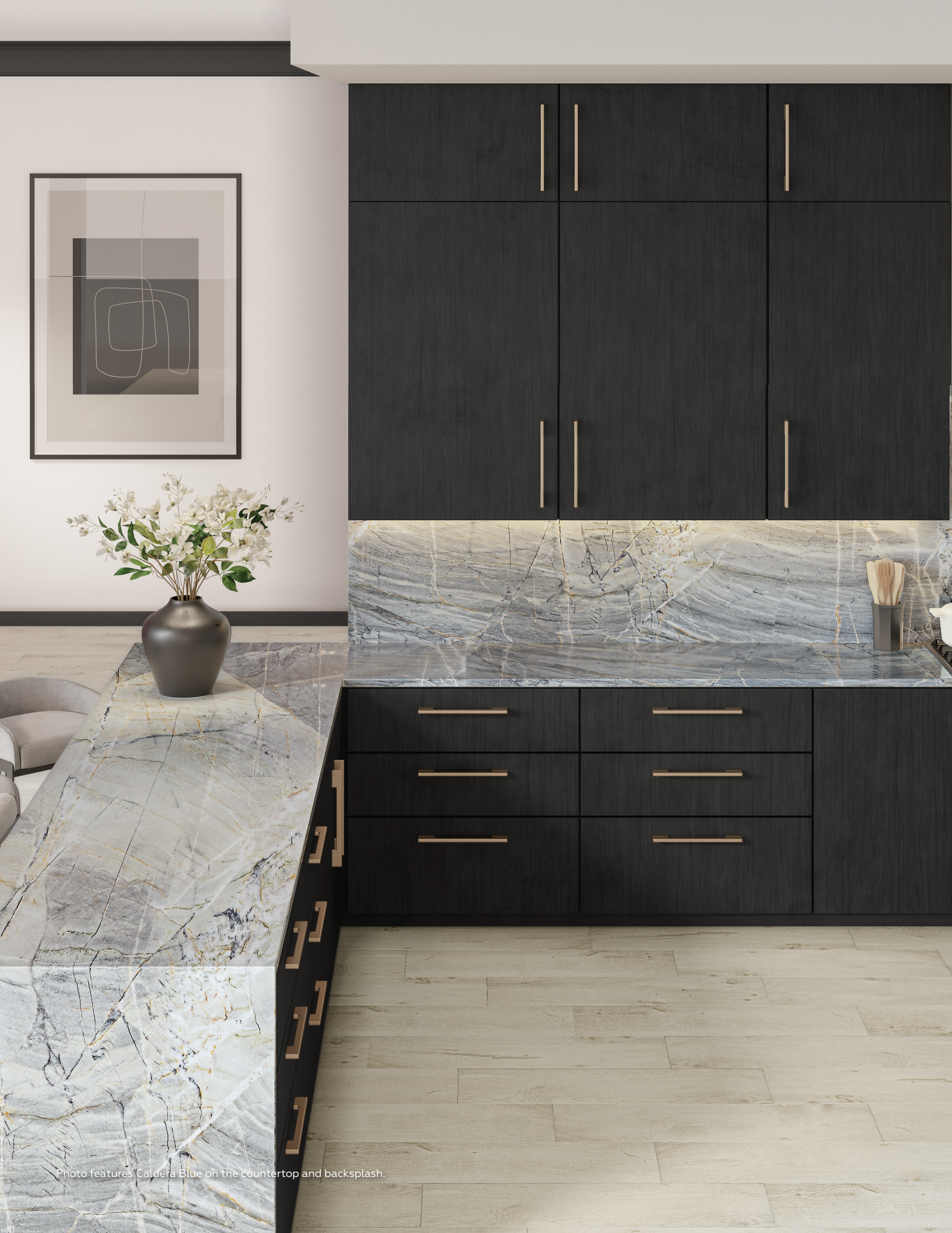
Photo features Caldera Blue on the countertop and backsplash.