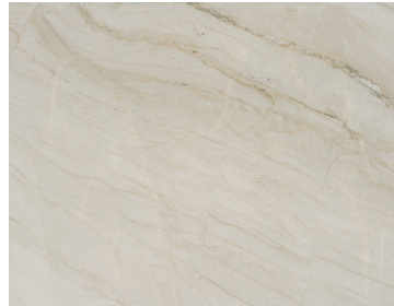
TAHITIAN CREAM Q101 3/4" (2cm) & 1-1/4" (3cm) Polished