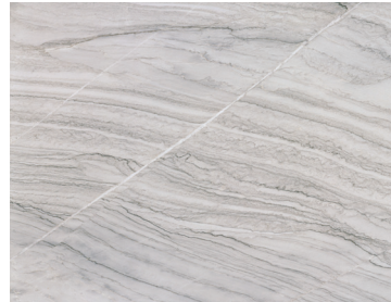
WHITE PEARL Q771 3/4" (2cm) & 1-1/4" (3cm) Polished