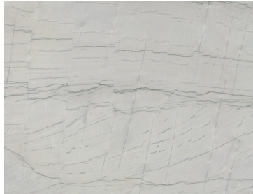
CALACATTA QUARTZITE Q721 3/4" (2cm) & 1-1/4" (3cm) Polished