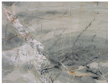
CALDERA BLUE Q749 3/4" (2cm) & 1-1/4" (3cm) Polished