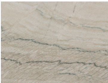
MACAUBAS FANTASY Q771 3/4" (2cm) & 1-1/4" (3cm) Polished