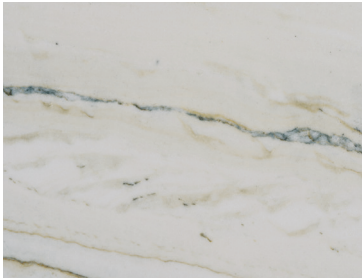
SERENO Q405 3/4" (2cm) & 1-1/4" (3cm) Polished