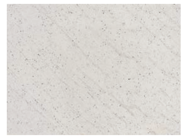
EXTREME WHITE G068 3/4" (2cm) & 1-1/4" (3cm) – Polished