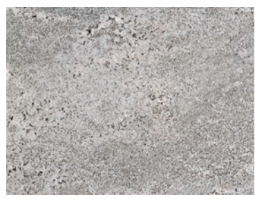
SADDLE WHITE G075 3/4" (2cm) & 1-1/4" (3cm) – Polished