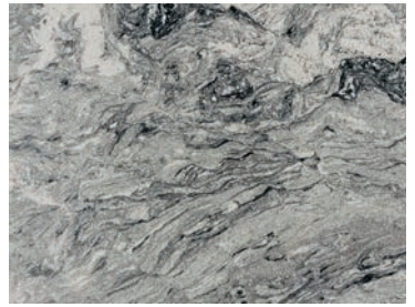
SIBERIAN WHITE G951 3/4" (2cm) & 1-1/4" (3cm) – Polished & Leather