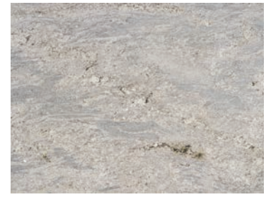
SALINAS WHITE G409 3/4" (2cm) & 1-1/4" (3cm) – Polished