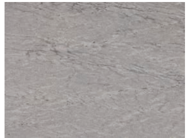
THUNDER WHITE G800 3/4" (2cm) & 1-1/4" (3cm) – Polished & Leather