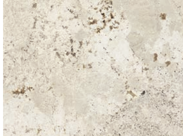
ADONIS WHITE G453 3/4" (2cm) & 1-1/4" (3cm) – Polished