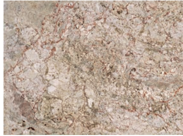
WHITE SPRING G539 3/4" (2cm) & 1-1/4" (3cm) – Polished