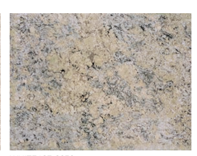
WHITE ICE G238 3/4" (2cm) & 1-1/4" (3cm) – Polished