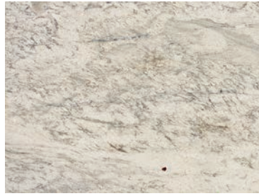
WHITE ANTICO G566 3/4" (2cm) & 1-1/4" (3cm) – Polished