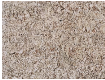
BIANCO ANTICO G446 3/4" (2cm) & 1-1/4" (3cm) – Polished