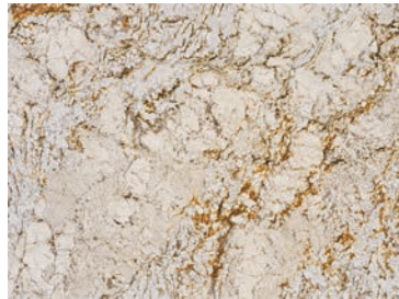
ZERMATT G540 3/4" (2cm) & 1-1/4" (3cm) - Polished