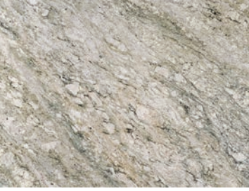
KEMPTON PARK G073 3/4" (2cm) & 1-1/4" (3cm) – Polished