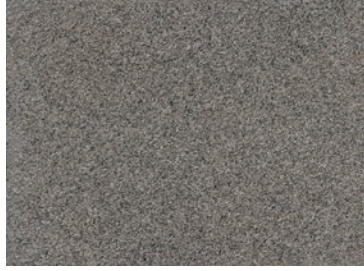
NEW CALEDONIA G285 3/4" (2cm) & 1-1/4" (3cm) - Polished