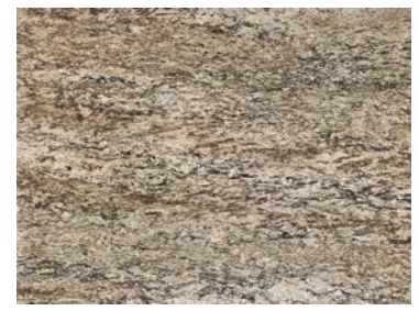
BIANCO LUCRE G203 3/4" (2cm) & 1-1/4" (3cm) – Polished