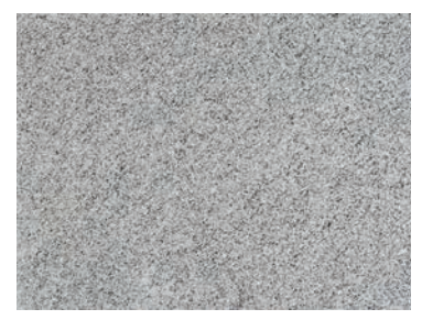
BENGAL WHITE G234 3/4" (2cm) & 1-1/4" (3cm) – Polished