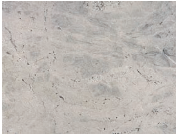
HIMALAYA WHITE G217 3/4" (2cm) & 1-1/4" (3cm) – Polished