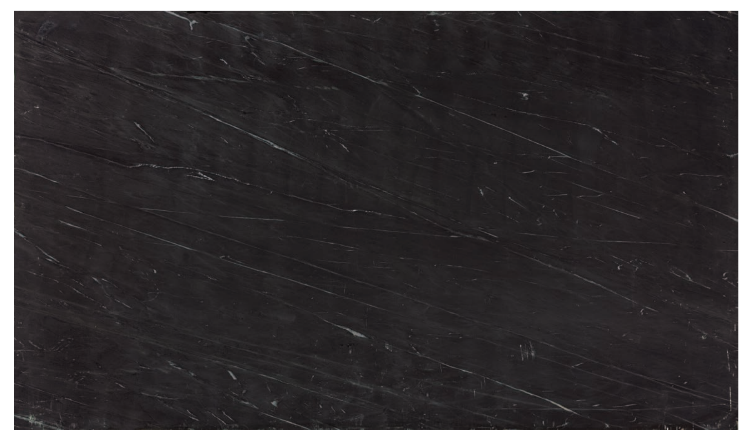
BLACK SOAPSTONE S601 3/4" (2cm) & 1-1/4" (3cm) - Honed