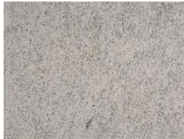
DALLAS WHITE G023 3/4" (2cm) & 1-1/4" (3cm) – Polished