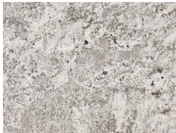
RIGEL WHITE G074 3/4" (2CM) & 1-1/4" (3CM) - POLISHED