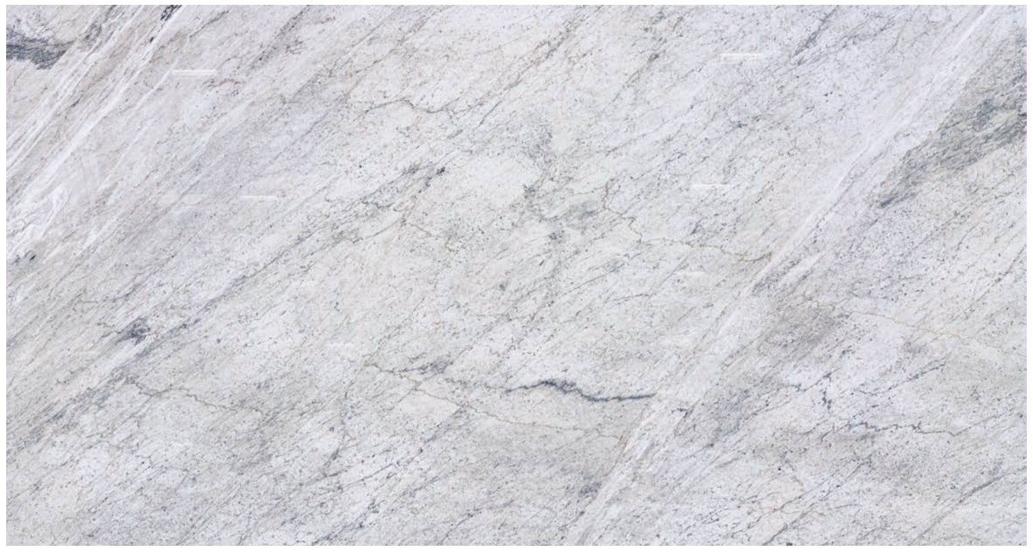
CARRARA WHITE M701 3/4" (2cm) & 1-1/4" (3cm) – Polished & Honed