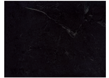
BLACK MIST G756 3/4" (2cm) & 1-1/4" (3cm) – Honed