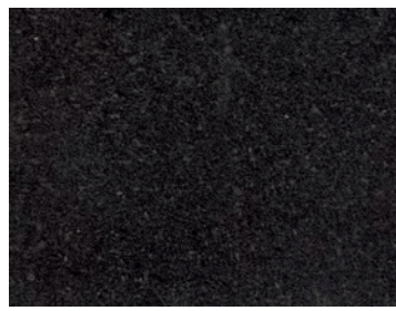
SILVER PEARL G259 3/4" (2cm) & 1-1/4" (3cm) – Polished & Leather