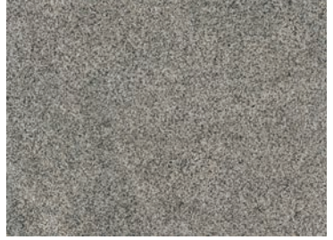
AZUL PLATINO G247 3/4" (2cm) & 1-1/4" (3cm) - Polished