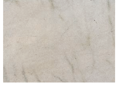
WHITE FANTASY G045 3/4" (2cm) & 1-1/4" (3cm) – Polished