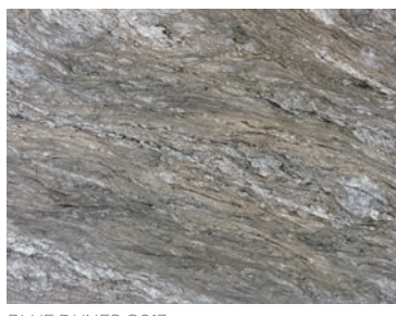
BLUE DUNES G017 3/4" (2cm) & 1-1/4" (3cm) – Polished & Caressed