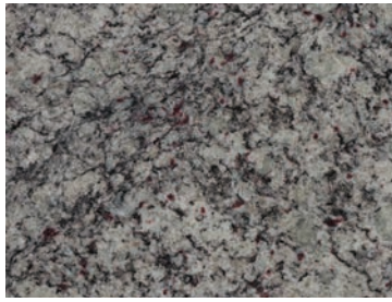
ASHEN WHITE G856 3/4" (2cm) & 1-1/4" (3cm) - Polished