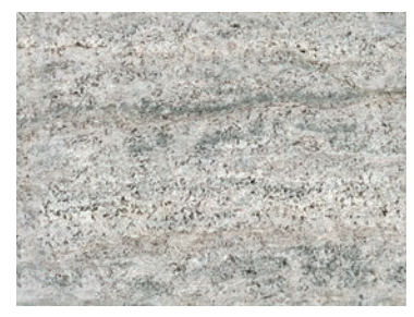
ECHANTED FOREST G930 3/4" (2cm) & 1-1/4" (3cm) – Polished