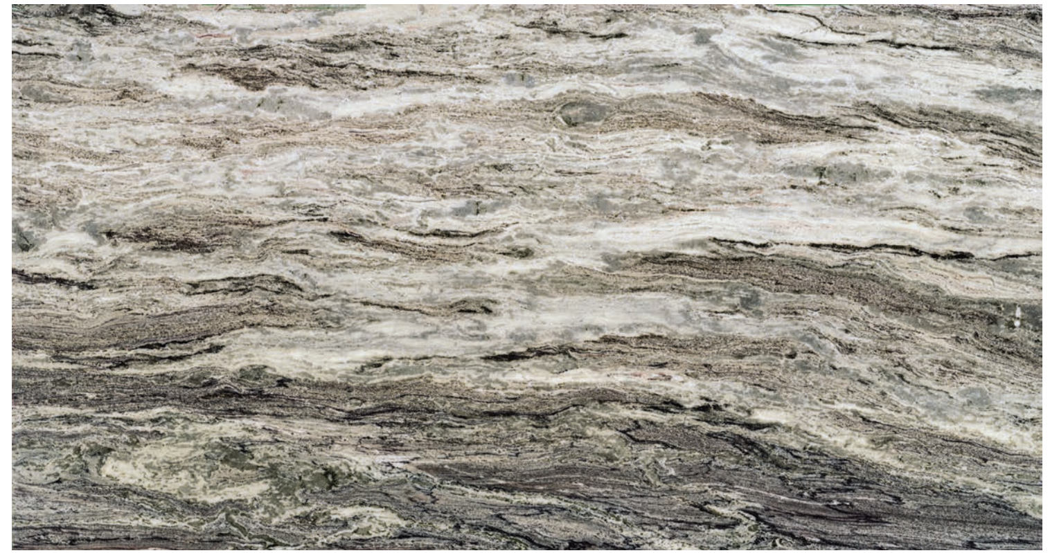
FANTASY BROWN M817 3/4" (2cm) & 1-1/4" (3cm) – Polished & Leathered