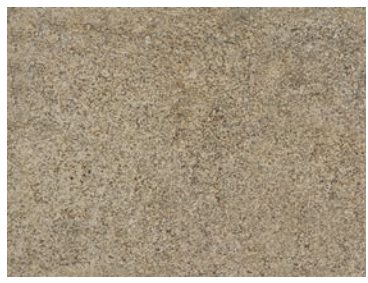
SANTA CECILIA G287 3/4" (2cm) & 1-1/4" (3cm) – Polished