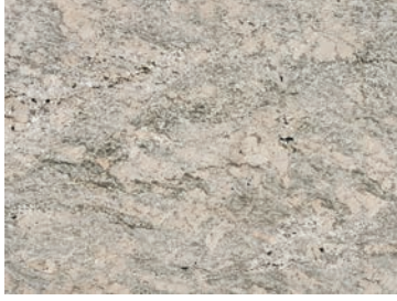
GRAND VALLEY G072 3/4" (2cm) & 1-1/4" (3cm) – Polished