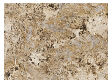
DELICATUS GOLD G510 3/4" (2cm) & 1-1/4" (3cm) – Polished