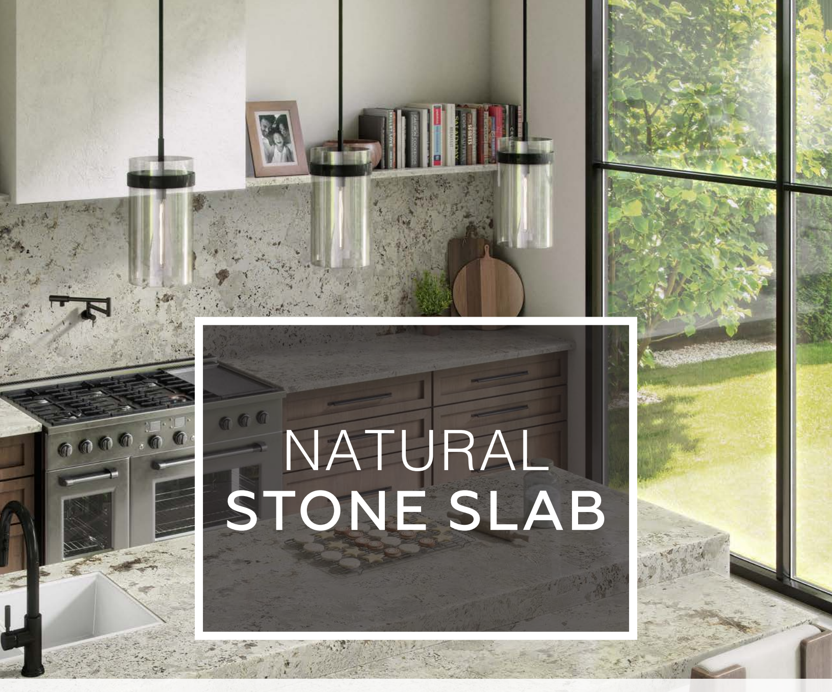
MARBLE | GRANITE | SOAPSTONE