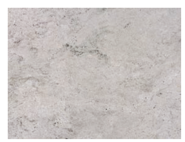
COTTON WHITE G958 3/4" (2cm) & 1-1/4" (3cm) – Polished