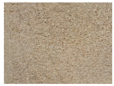
GIALLO ORNAMENTAL G331 3/4" (2cm) & 1-1/4" (3cm) – Polished