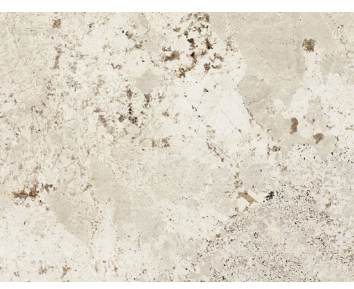
ADONIS WHITE G453 3/4" (2cm) & 1-1/4" (3cm) – Polished