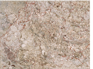
WHITE SPRING G539 3/4" (2cm) & 1-1/4" (3cm) – Polished