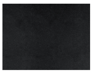
ABSOLUTE BLACK G771 3/4" (2cm) & 1-1/4" (3cm) –Polished & Honed