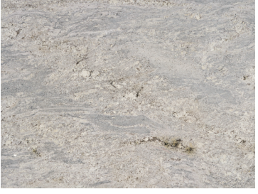
SALINAS WHITE G409 3/4" (2cm) & 1-1/4" (3cm) – Polished