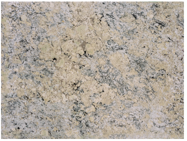
WHITE ICE G238 3/4" (2cm) & 1-1/4" (3cm) – Polished