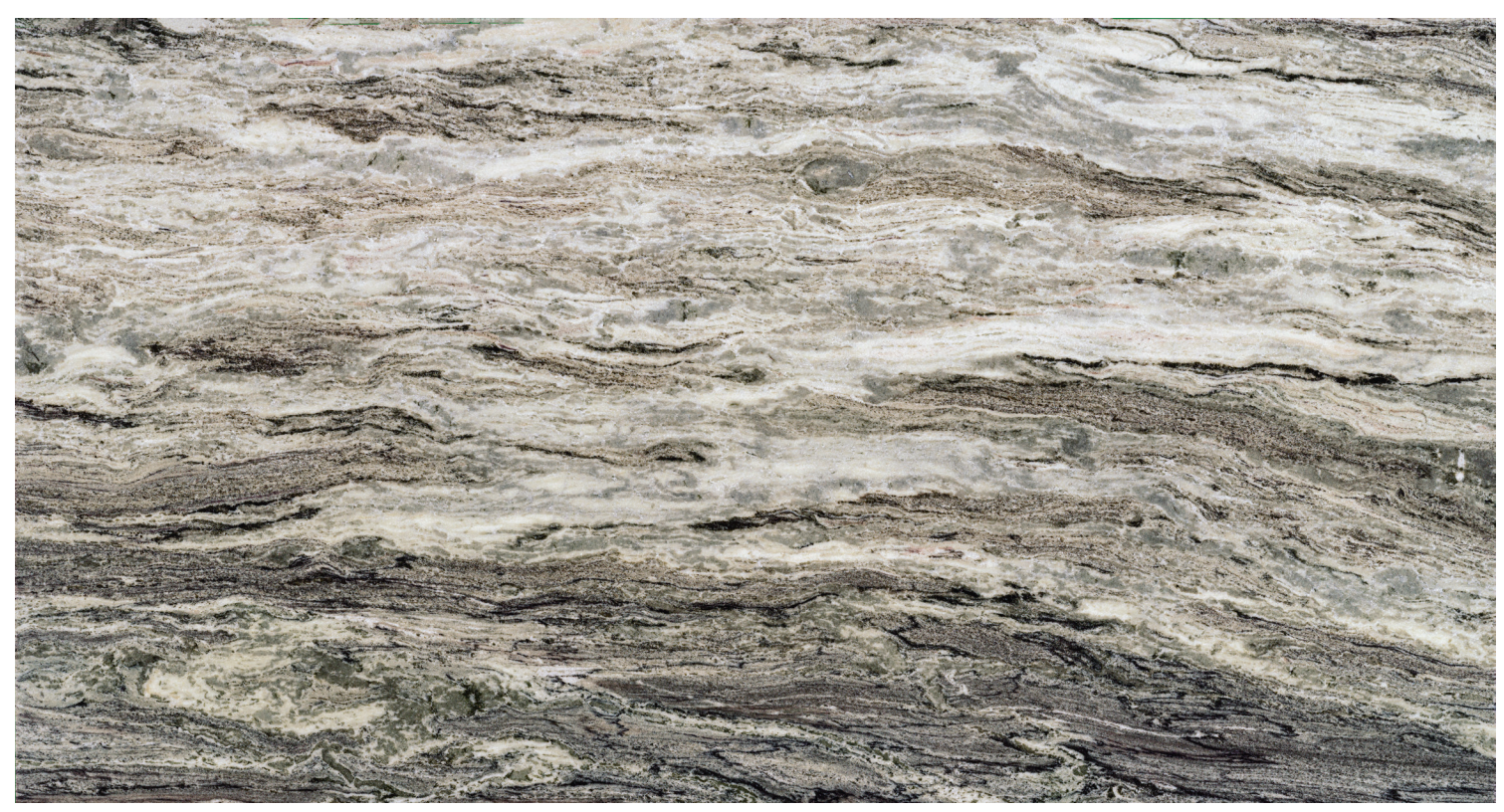
FANTASY BROWN M817 3/4" (2cm) & 1-1/4" (3cm) – Polished & Leathered