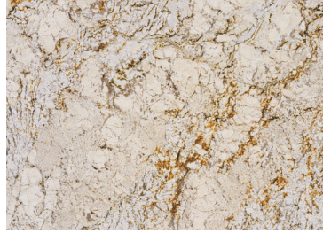
ZERMATT G540 3/4" (2cm) & 1-1/4" (3cm) – Polished