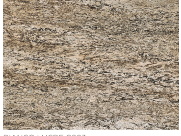
BIANCO LUCRE G203 3/4" (2cm) & 1-1/4" (3cm) – Polished