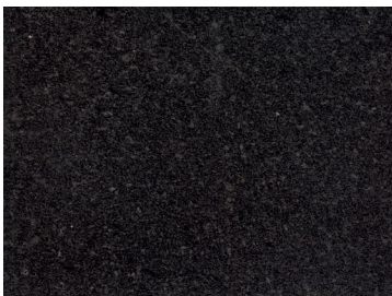
SILVER PEARL G259 3/4" (2cm) & 1-1/4" (3cm) – Polished & Leather