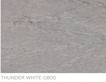
3/4" (2cm) & 1-1/4" (3cm) – Polished & Leather