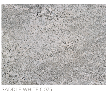
3/4" (2cm) & 1-1/4" (3cm) – Polished