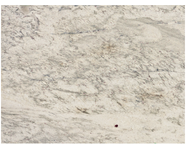
WHITE ANTICO G566 3/4" (2cm) & 1-1/4" (3cm) – Polished