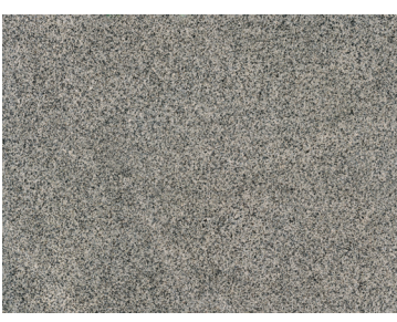
AZUL PLATINO G247 3/4" (2cm) & 1-1/4" (3cm) – Polished