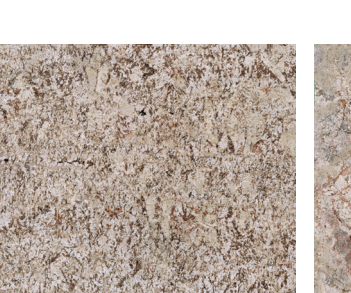
BIANCO ANTICO G446 3/4" (2cm) & 1-1/4" (3cm) – Polished