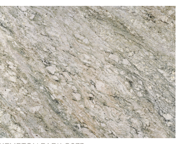
KEMPTON PARK G073 3/4" (2cm) & 1-1/4" (3cm) - Polished