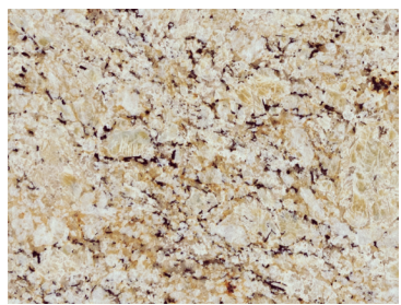
PEARL ESSENCE G125 3/4" (2cm) & 1-1/4" (3cm) - Polished