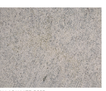
DALLAS WHITE G023 3/4" (2cm) & 1-1/4" (3cm) – Polished