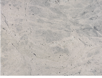
HIMALAYA WHITE G217 3/4" (2cm) & 1-1/4" (3cm) – Polished