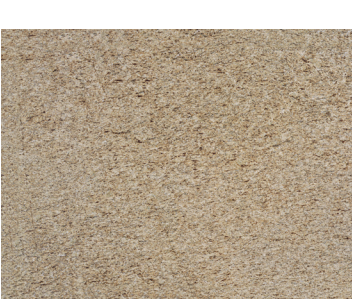
GIALLO ORNAMENTAL G331 3/4" (2cm) & 1-1/4" (3cm) – Polished