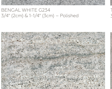
ECHANTED FOREST G930 3/4" (2cm) & 1-1/4" (3cm) – Polished