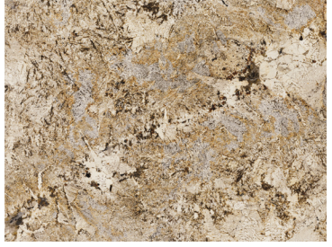
DELICATUS GOLD G510 3/4" (2cm) & 1-1/4" (3cm) – Polished