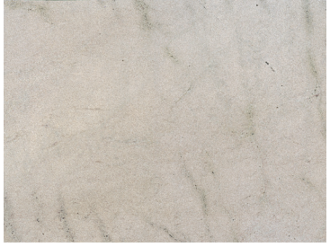
WHITE FANTASY G045 3/4" (2cm) & 1-1/4" (3cm) – Polished