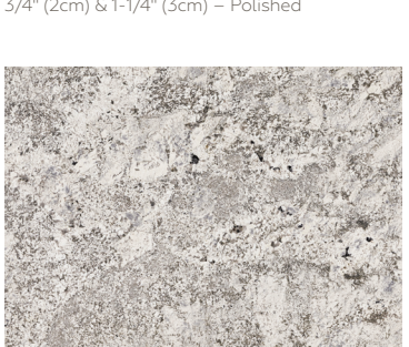
RIGEL WHITE G074 3/4" (2CM) & 1-1/4" (3CM) - POLISHED