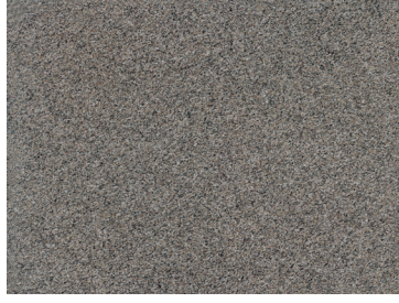
NEW CALEDONIA G285 3/4" (2cm) & 1-1/4" (3cm) – Polished