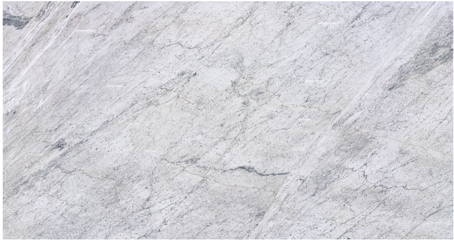
CARRARA WHITE M701 3/4" (2cm) & 1-1/4" (3cm) – Polished & Honed