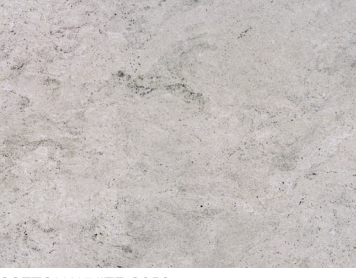
COTTON WHITE G958 3/4" (2cm) & 1-1/4" (3cm) – Polished