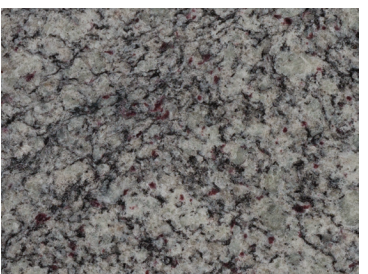
ASHEN WHITE G856 3/4" (2cm) & 1-1/4" (3cm) – Polished