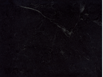
BLACK MIST G756 3/4" (2cm) & 1-1/4" (3cm) – Honed