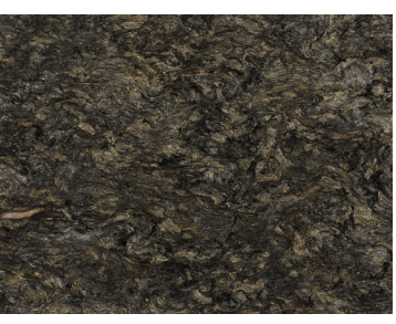
COSMOS C833 TAMBORA TIDE G367 3/4" (2cm) & 1-1/4" (3cm) – Polished & Leathered 3/4" (2cm) & 1-1/4" (3cm) – Polished & Leathered