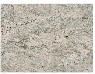
GRAND VALLEY G072 3/4" (2cm) & 1-1/4" (3cm) – Polished