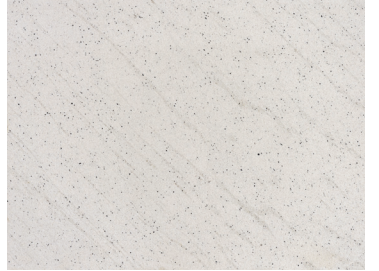
EXTREME WHITE G068 3/4" (2cm) & 1-1/4" (3cm) – Polished