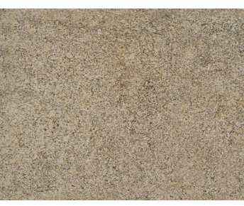
SANTA CECILIA G287 3/4" (2cm) & 1-1/4" (3cm) – Polished