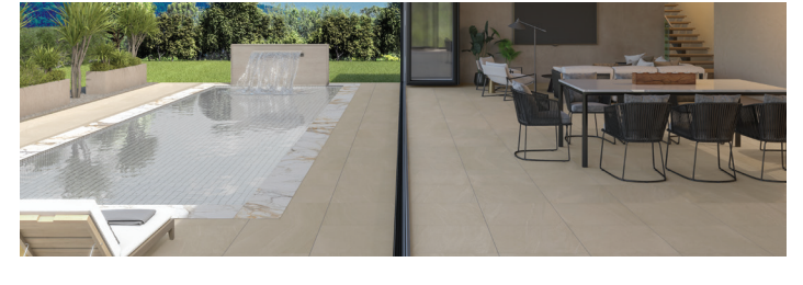
3D Cube Mosaic Tile (Mesh-mounted)