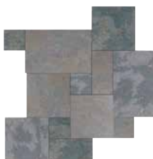
INDIAN MULTICOLOR S771 16" x 24", 16" x 16", 8" x 16", 8" x 8" Versailles Pattern Natural Cleft Gauged*