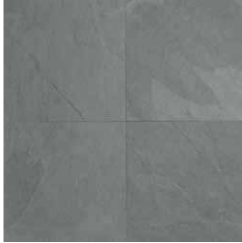
BRAZIL GRAY S201 12" x 24", 16" x 16" & 12" x 12" Natural Cleft Gauged