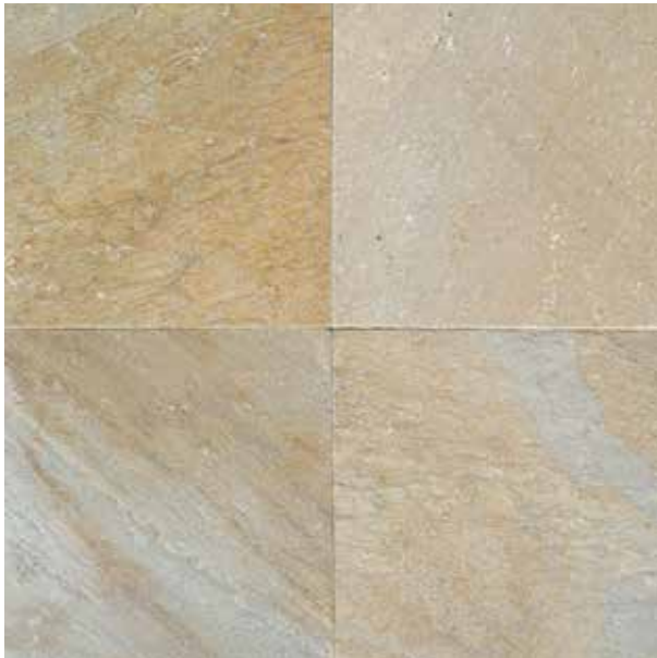
GOLDEN SUN S783 16" x 16" & 12" x 12" Natural Cleft Gauged