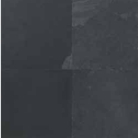
BRAZIL BLACK S762 12" x 24", 16" x 16" & 12" x 12" Natural Cleft Gauged