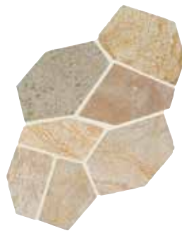
GOLDEN SUN S783 Pattern Flagstone Natural Cleft Gauged**