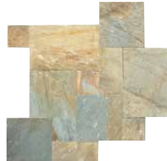
GOLDEN SUN S783 16" x 24", 16" x 16", 8" x 16", 8" x 8" Versailles Pattern Natural Cleft Gauged*