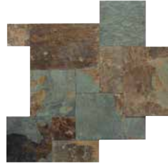
MONGOLIAN SPRING S781 16" x 24", 16" x 16", 8" x 16", 8" x 8" Versailles Pattern Natural Cleft Gauged*