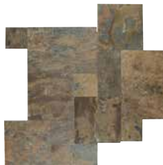
CALIFORNIA GOLD S700 16" x 24", 16" x 16", 8" x 16", 8" x 8" Versailles Pattern Natural Cleft Gauged*