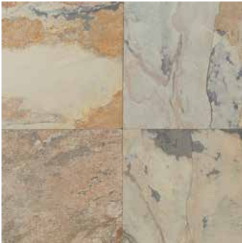
AUTUMN MIST S772 16" x 16" & 12" x 12" Natural Cleft Gauged