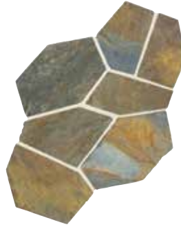
MONGOLIAN SPRING S781 Pattern Flagstone Natural Cleft Gauged**