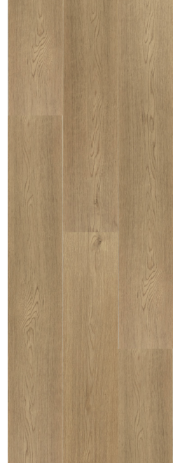
FRENCH COUNTRY HP33