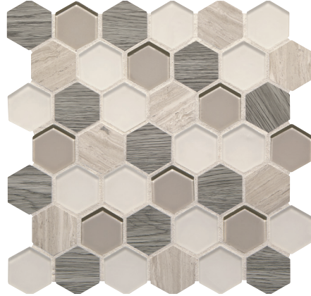
SERENE STORM IB04