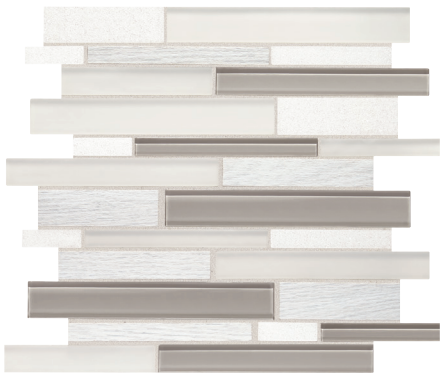
TRANQUIL SNOW IB01