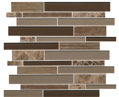
RUSTIC EVE IB03