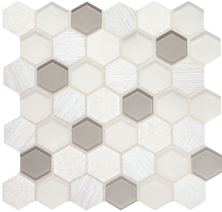
TRANQUIL SNOW IB01