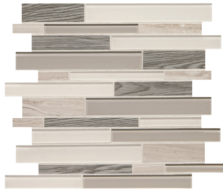
SERENE STORM IB04