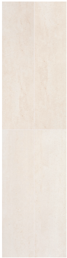
OFF WHITE CC08