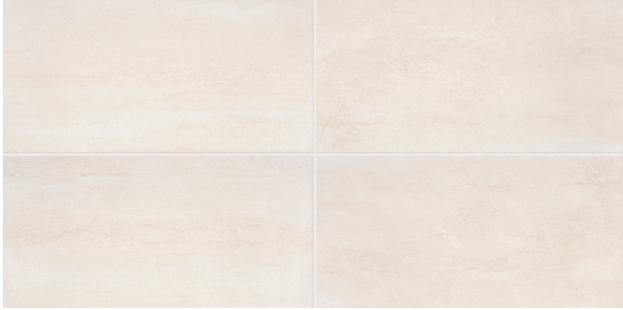
OFF WHITE CC08