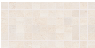
OFF WHITE CC08