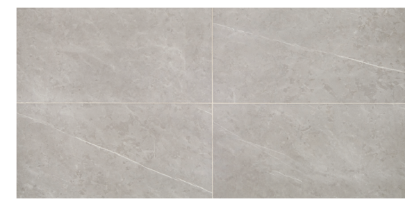
STAMINA GREY RL23