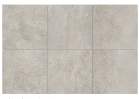
LIGHT BEIGE AR31 OFF WHITE AR30 LIGHT GRAY AR32