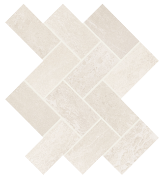
2 x 4 HERRINGBONE MOSAIC - DOT-MOUNTED ON 14 x 12 SHEET