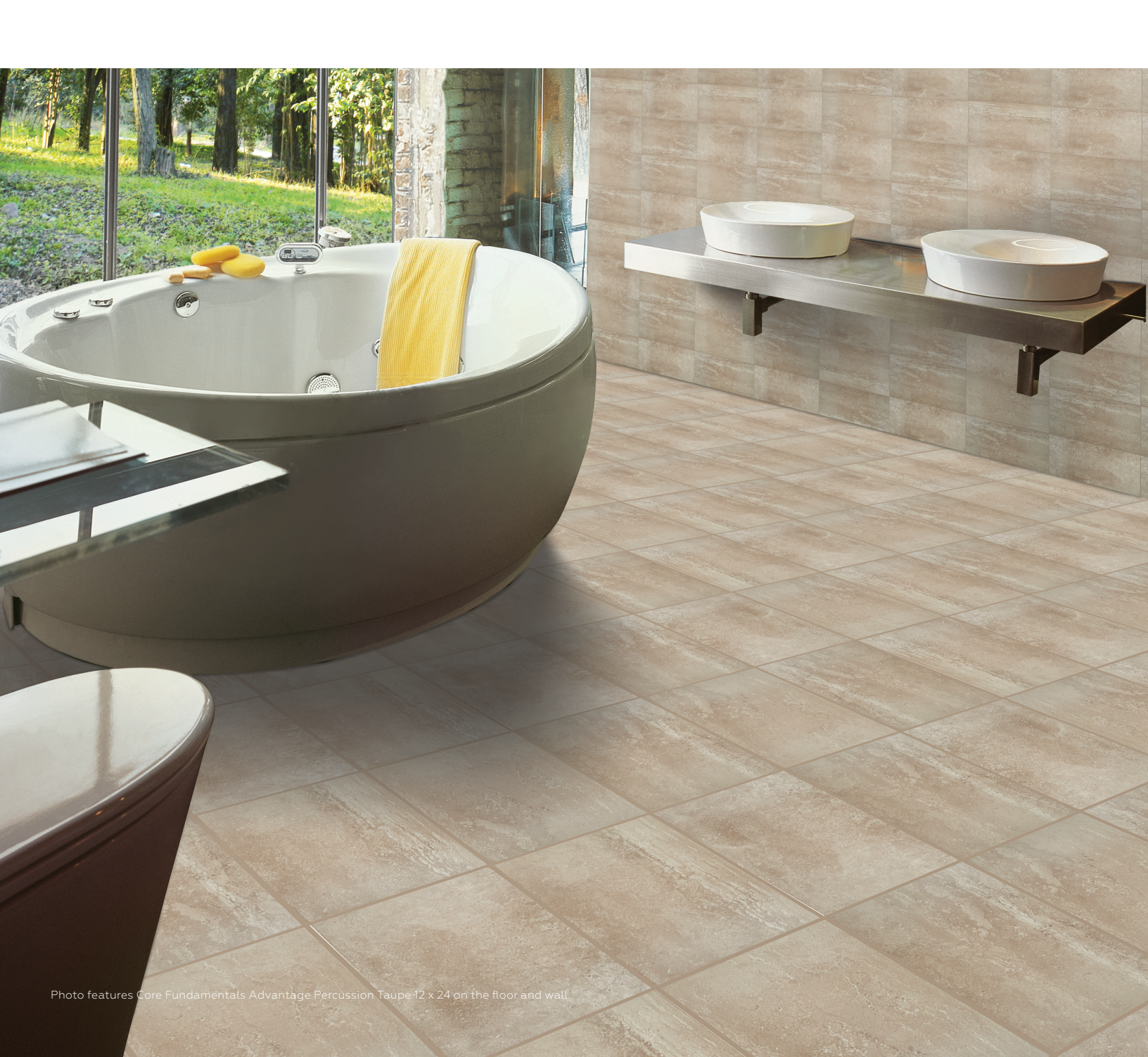
12 x 12 Tile Floor T