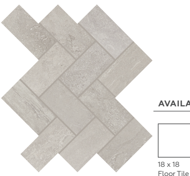
AVAILABLE TILE SIZES