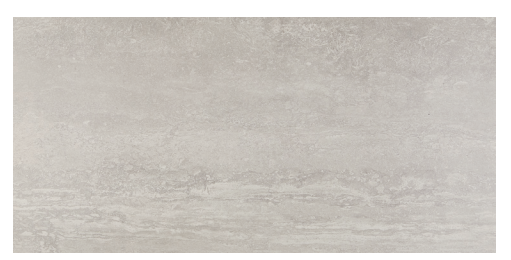
ARIA WHITE EP20 PERCUSSION TAUPE EP21 TRUMPET GREY EP22