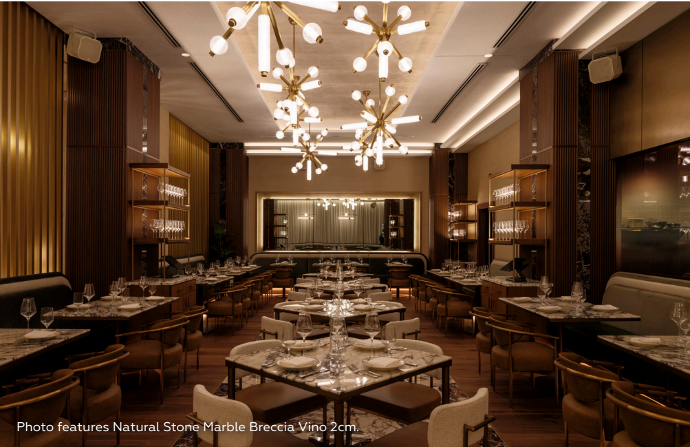
Photo features Natural Stone Marble Breccia Vino 2cm.