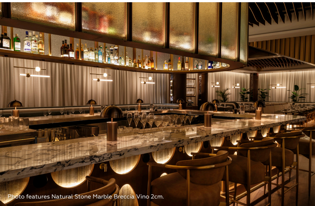
Photo features Natural Stone Marble Breccia Vino 2cm.

At 1587 Prime, your experience begins before anyone is seated.