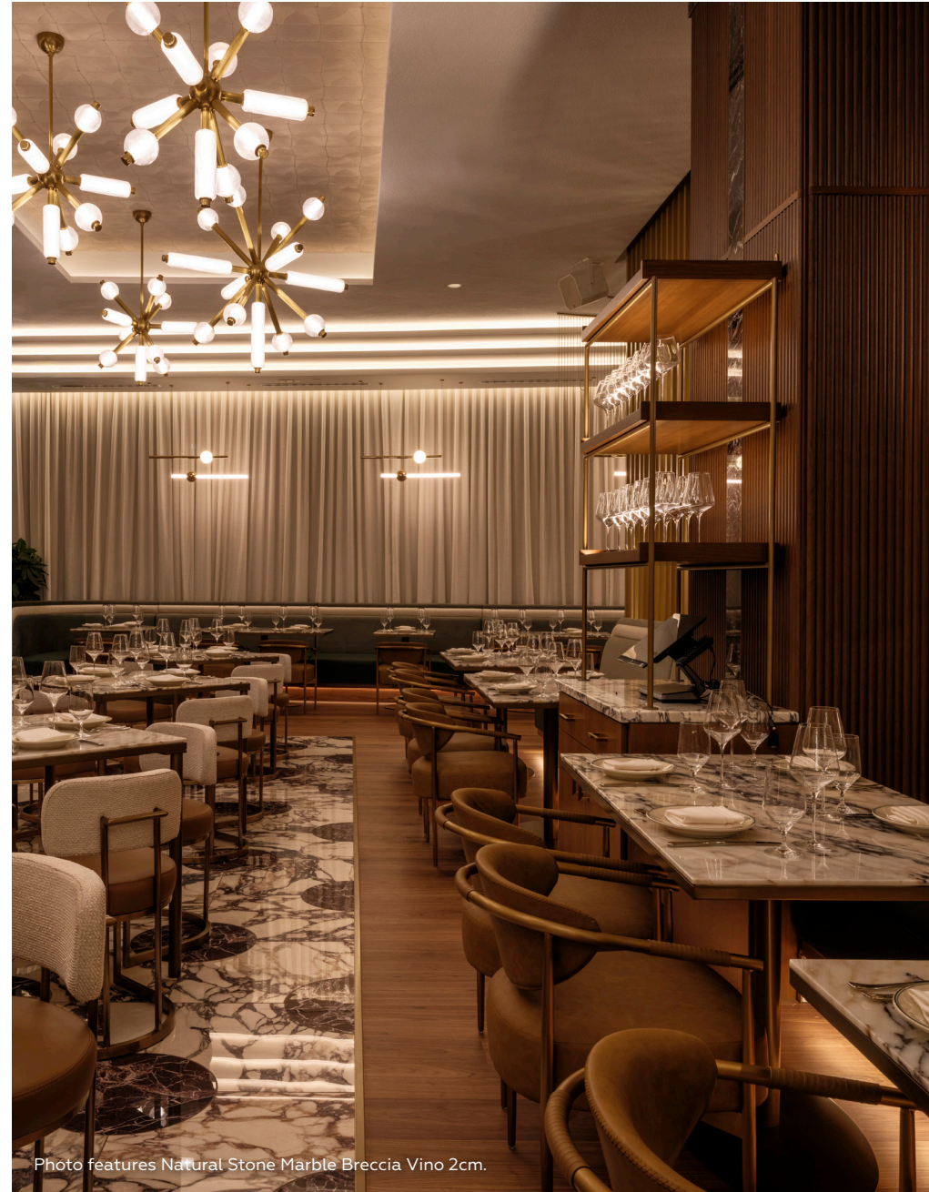
Photo features Natural Stone Marble Breccia Vino 2cm.

The interior was designed by The Johnson Studio at Cooper Carry, with a clear brand identity in mind: create a space that honors Kansas City's legacy while transforming it into something entirely novel. The goal was to balance drama with warmth, delivering an atmosphere that feels elevated. Achieving that vision required surfaces that could carry the weight of that ambition all the way from front of house to back of house.