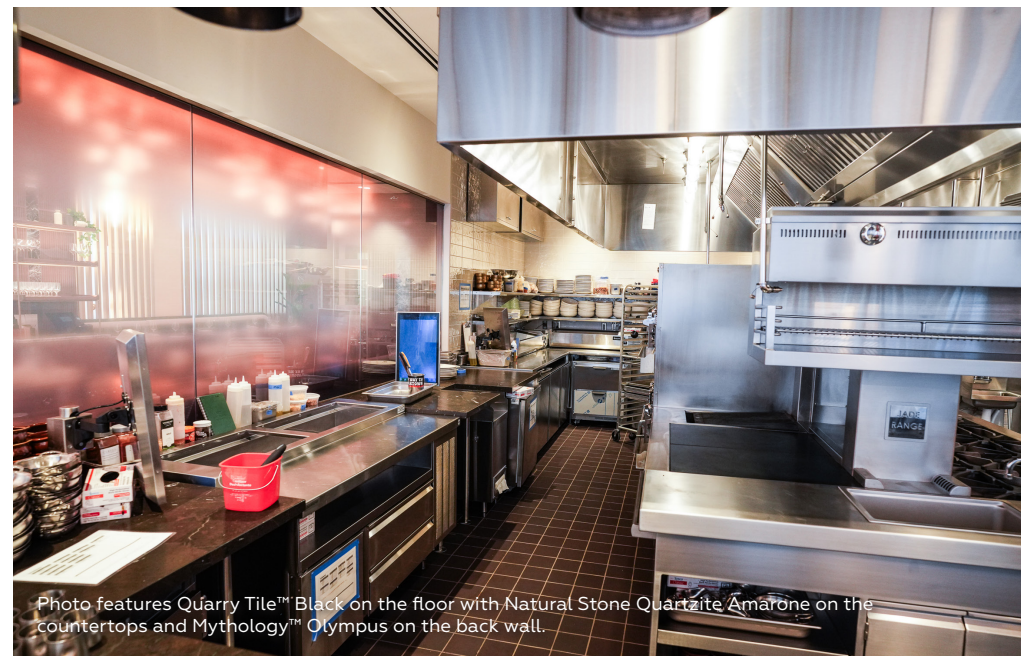
Photo features Quarry Tile™ Black on the floor with Natural Stone Quartzite Amarone on the countertops and Mythology™ Olympus on the back wall.