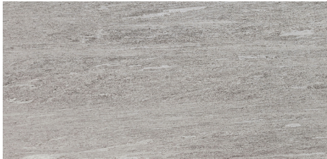
JET-SETTER DUSK AM34