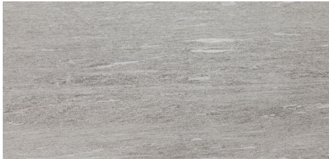
JET-SETTER DUSK AM34