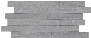
GLOBAL GREY AM35