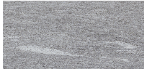
GLOBAL GREY AM35