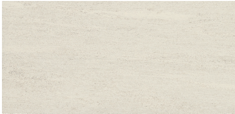
WANDERLUST WHITE AM36