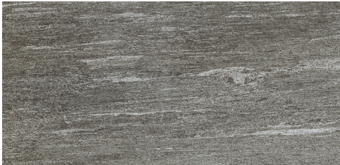
VOYAGER BLACK AM33