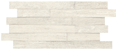
WANDERLUST WHITE AM36