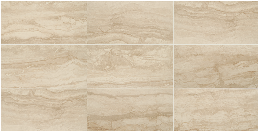
LIGHT NOCE VL07