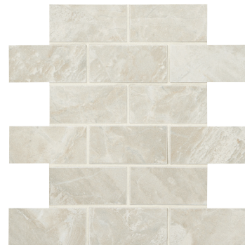
SILVER MARBLE ML72