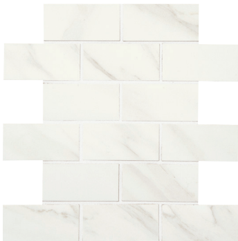
BIANCO CARRARA ML70