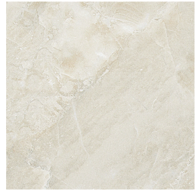
SILVER MARBLE ML72