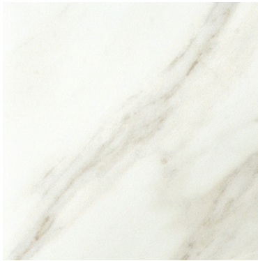
BIANCO CARRARA ML70