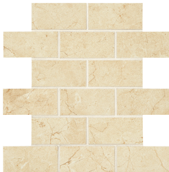
CREMA LAILA ML71