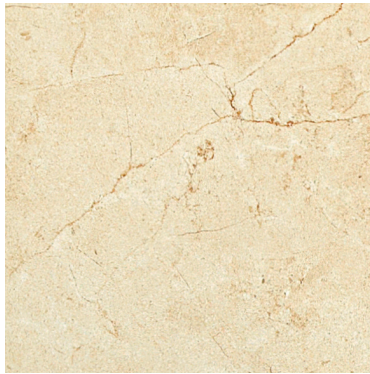
CREMA LAILA ML71