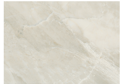
SILVER MARBLE ML72