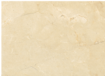
CREMA LAILA ML71